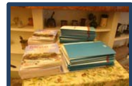
▶ Lebanon Traveler Magazine

and will be available in major bookstores such as Virgin Mega store, Antoine bookstore, restaurant and hotel chains across the country. The fresh, 50 page magazine is an engaging read and can be used as a seasonal touristic guidebook. It deals with topics ranging from international tourism trends, local festivity customs, in-depth interviews with tourism entrepreneurs all the way to where the readers can find unknown local "must visit" in rural areas. This magazine is a model achievement for partnership between private sector and civil society working together towards sustainable economic development in the regions of Lebanon through tourism and hospitality sector support.